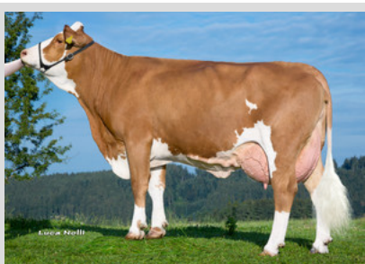
Fleckvieh IMPERATIV dam Urke 2.lac.