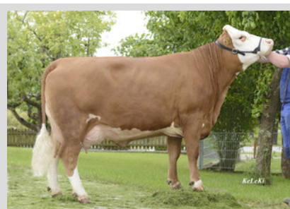
Impression - Hilde