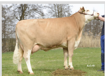
Impression - daughter Sibille