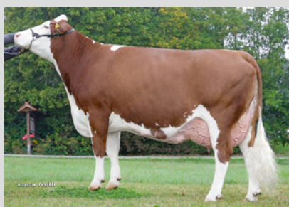
Fleckvieh: VERNANDO dam Roleva 2.lac.